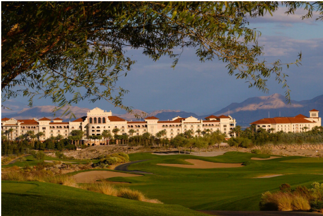
JW Marriott Las Vegas Resort & Spa